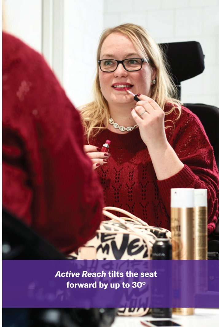
Active Reach tilts the seat forward by up to 30°

QuickConfig is a new innovative app designed for service technicians, clinicians, and providers that offers a simpler way to configure parameters and an intuitive interface to set up F3 Corpus with your preferred driving and seating characteristics.