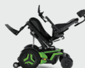
Posterior tilt 0-50°