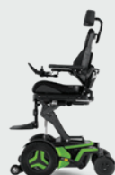
Seat elevator Active Height 0-300 mm