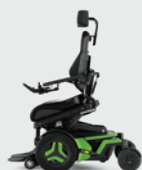
Anterior tilt Active Reach* 5-30° 20° and 30° require VS legrest