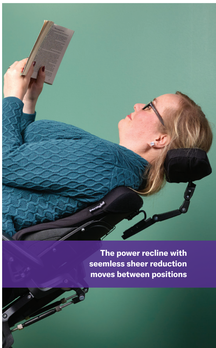
The power recline with seamless sheer reduction moves between positions