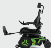
Power and manual leg rest 90-180°